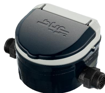
PPS With 40% Fiberglass